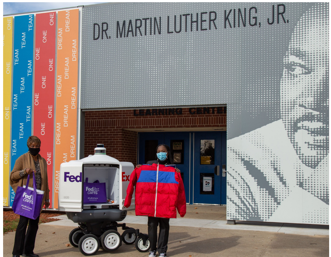
School leaders receiving Operation Warm coat with help from Roxo.

In previous years, FedEx team members volunteered to pass out coats, but COVID-19 restrictions meant we had to get creative. Volunteers filmed video messages, virtually read stories, and provided students with positive “warm thoughts” coloring sheets. We also helped pass out STEM educational booklets from the Smithsonian Institution that were printed and delivered by FedEx Office. And in Dallas, Roxo™, the FedEx SameDay Bot made a special appearance to deliver the coats to kids.