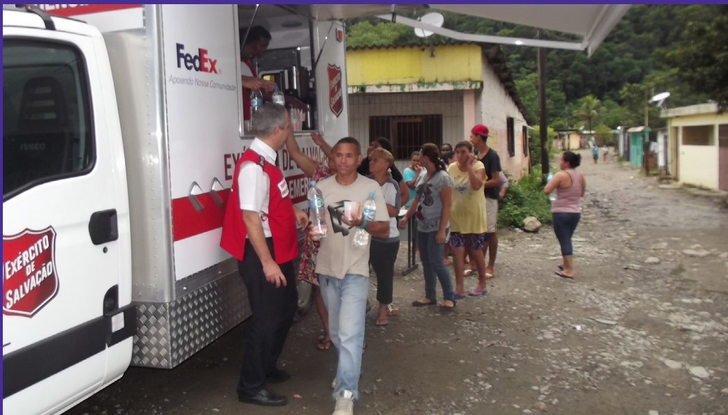
Volunteers hand out meals and water to families impacted by COVID-19 in Brazil