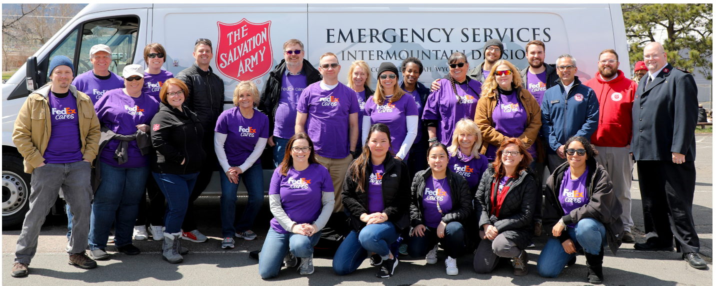
FedEx Cares volunteers with Salvation Army representatives in Colorado Springs with the new Emergency Disaster Services vehicle donated by FedEx; FedEx Cares volunteers in Colorado Springs distribute hygiene kits and meals to the homeless.

In response to the COVID-19 pandemic, FedEx and the Salvation Army deployed a canteen truck in Brazil from May to December, five days per week. During this time, volunteers distributed over 60,000 meals to the homeless and vulnerable families.