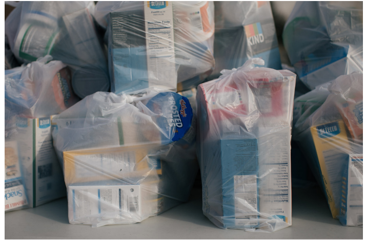
Food Bank of Contra Costa and Solano using the product that FedEx shipped for Feeding America to build disaster boxes and snack pack bags to sustain those who have been evacuated from their homes or permanently displaced due to the fires.