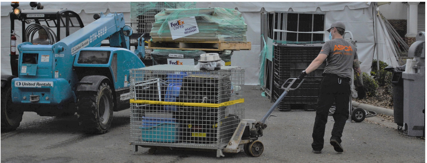
ASPCA receives a FedEx delivery of critically needed disaster relief provisions to meet the needs of abandoned animals.

We provided complimentary shipping to the ASPCA, providing three large trucks to move the supplies, weighing more than 53,000 pounds in total, from Missouri to the emergency shelter in Lake Charles.