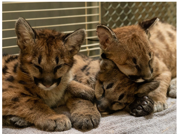
Mountain lion cubs are home for the holidays with help from FedEx