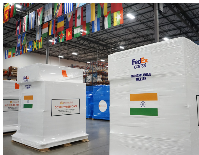
Critical medical supplies and personal protective equipment departing Santa Barbara, Calif., USA, bound for healthcare facilities in Kolkata, India.

FedEx supported Direct Relief with its annual FedEx Air & Ground NFL Awards program. We donated $40,000 to Direct Relief and during each week of the NFL season, we delivered a Medical Backpack (each filled with enough supplies to help 500 people) to a community clinic or health center in the hometowns of the FedEx Air & Ground selected players.