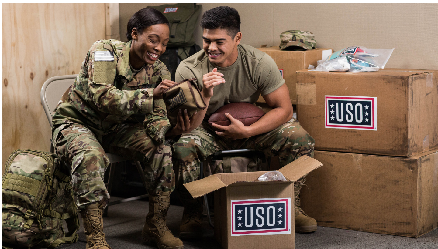
Service members assemble and ship USO care packages to U.S. troops stationed around the world.