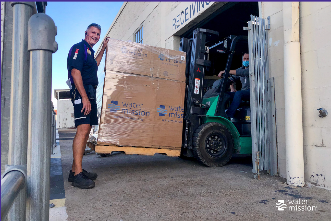
FedEx picks up more than 975,000 water purification packets from Water Mission bound for Vietnam. The packets will purify nearly 10 million liters of water.